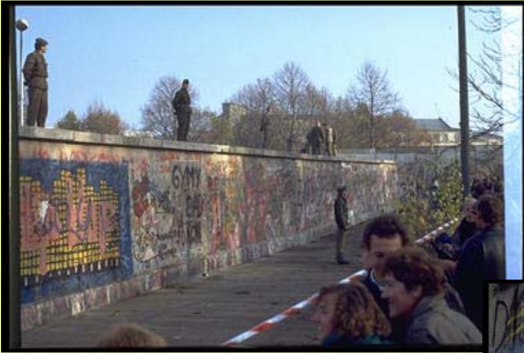
The Berlin Wall 1989