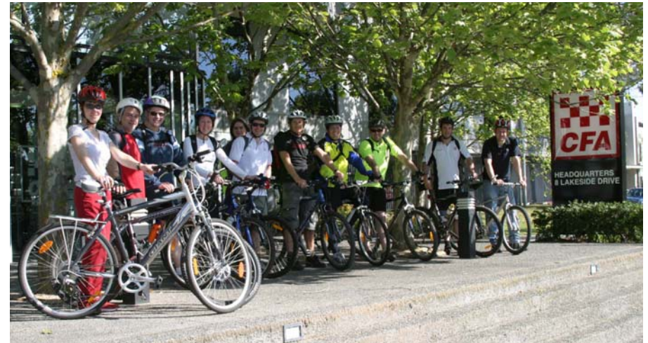
Ride to Work Day 2006